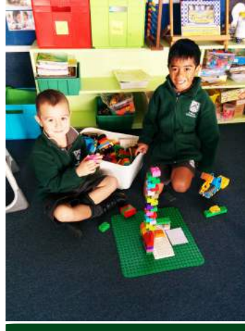
Tommy and Mina - building a beanstalk