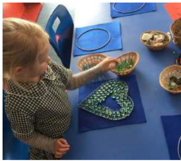
Clover - patterning and ordering play

"When children have the opportunity to play at length, and be involved with others in investigating possibilities and developing hypotheses, they try things out. They have little fear of failure, and through on-going and recurring experiences, they secure brain synapses that form the framework of their learned knowledge. Over time, their competence increases, and with this they develop confidence in their capability. Play allows children to be relaxed and work creatively, revisit experiences, solve problems, engage with others, and discover an endlessly new world". - Viv Shearsby, Core Education