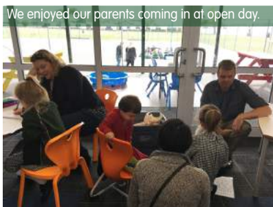
We enjoyed our parents coming in at open day.