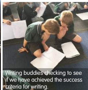
Writing buddies checking to see if we have achieved the success criteria for writing.

In Maramatanga we are practising different ways to pray. Each Wednesday morning we begin the day with meditation. The children listen to a bible story and have a quiet time with God.