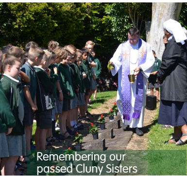
Remembering our passed Cluny Sisters