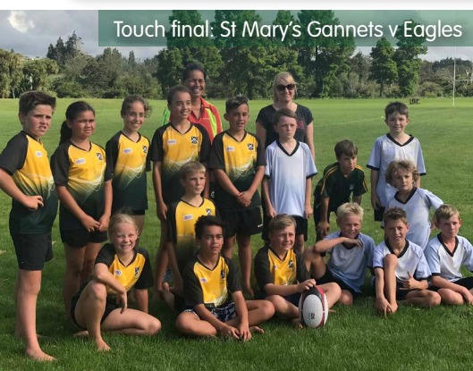
Touch final: St Mary's Gannets v Eagles