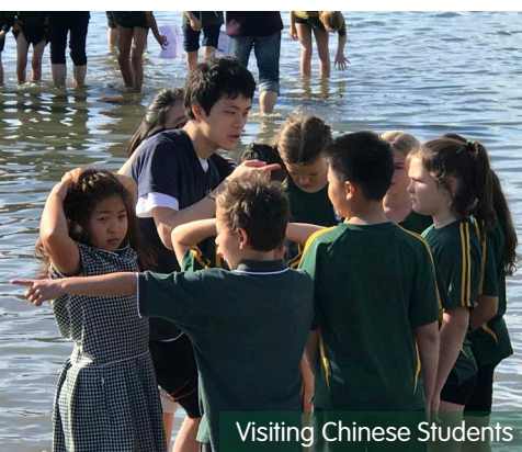
Visiting Chinese Students