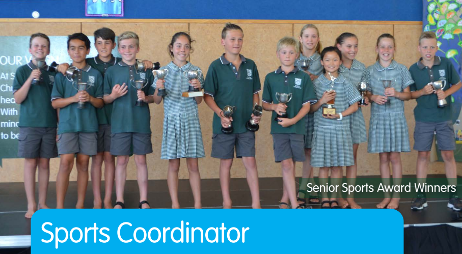
Senior Sports Award Winners