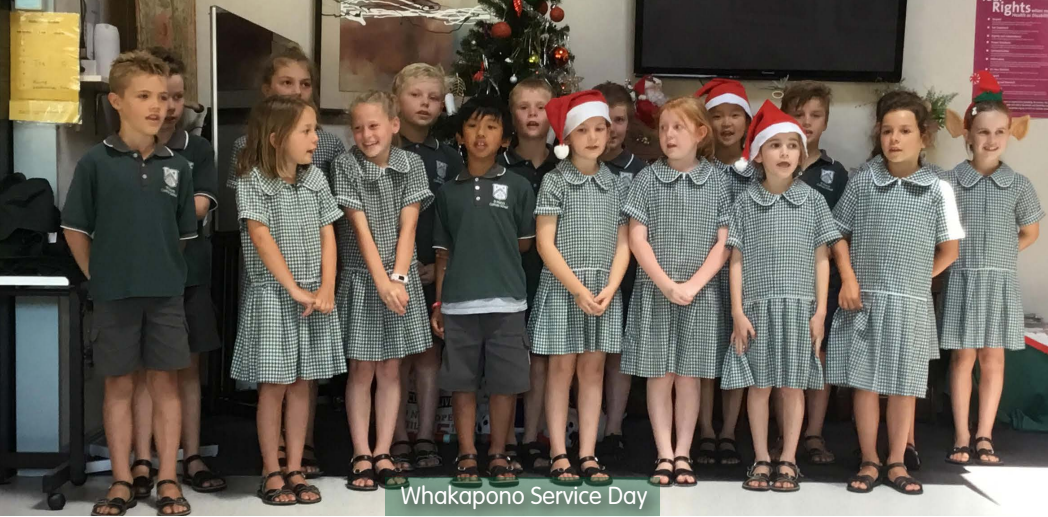
Whakapono Service Day