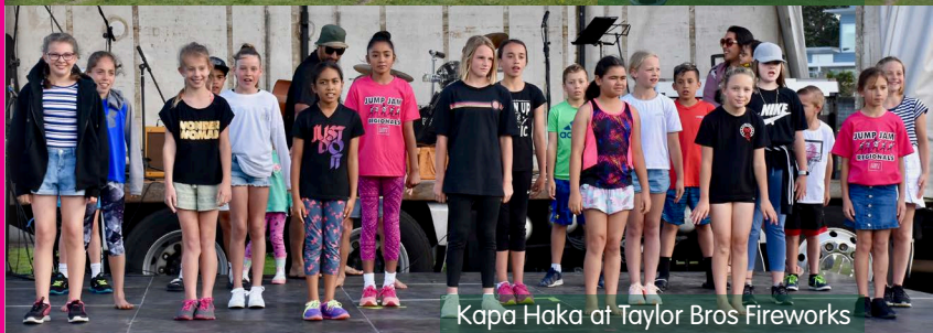
Kapa Haka at Taylor Bros Fireworks