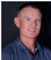
Tena Koutou Katoua

As the 2018 school year comes to a close I would like to take the opportunity to reflect on the year as a Principal and as a member of a remarkable school community. We are a high