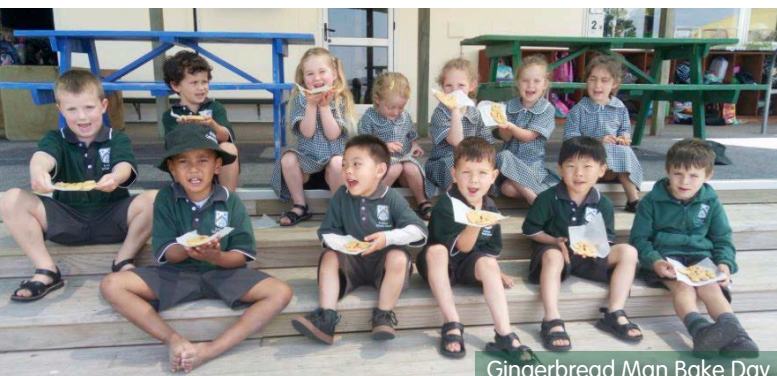
Gingerbread Man Bake Day