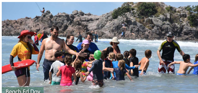
Beach Ed Day