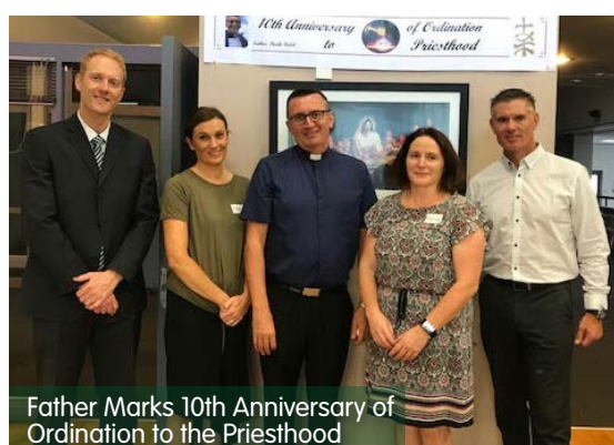
Father Marks 10th Anniversary of Ordination to the Priesthood