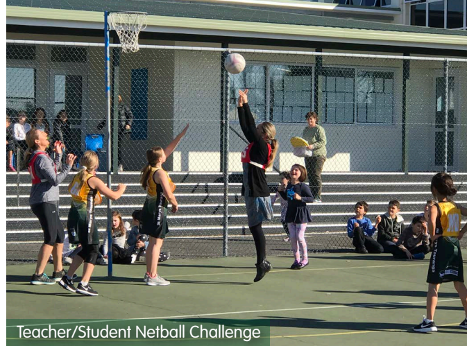
Teacher/Student Netball Challenge