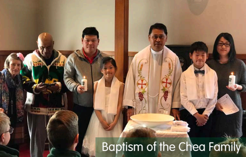
Baptism of the Chea Family