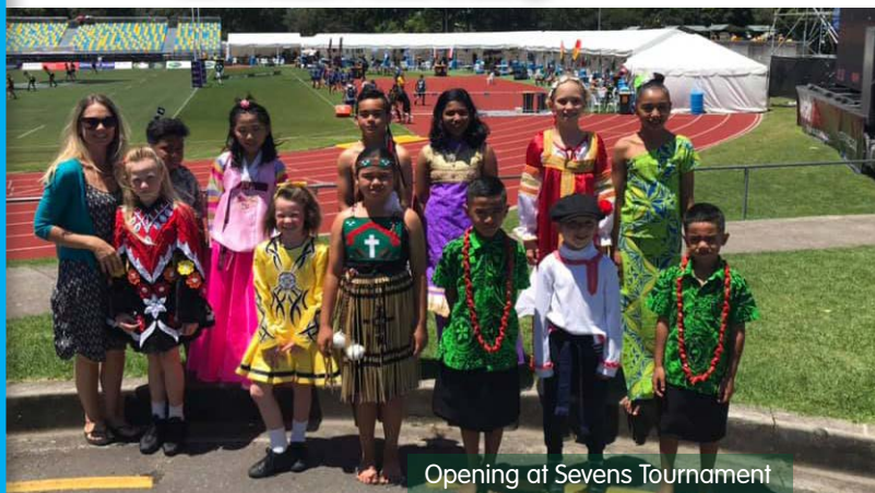
Opening at Sevens Tournament