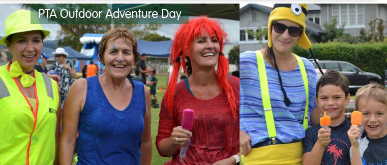
PTA Outdoor Adventure Day