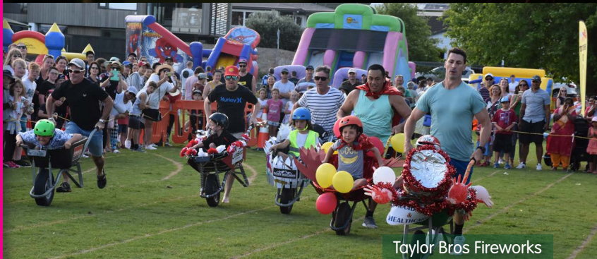
Taylor Bros Fireworks