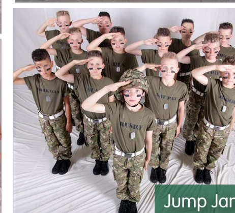
Jump Jam 2018