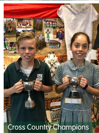
Cross Country Champions