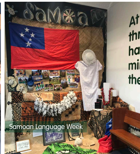
Samoan Language Week