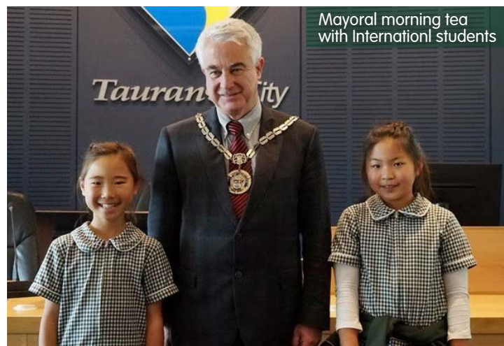
Mayoral morning tea with International students