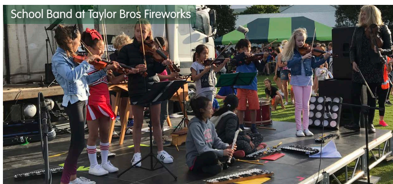
School Band at Taylor Bros Fireworks