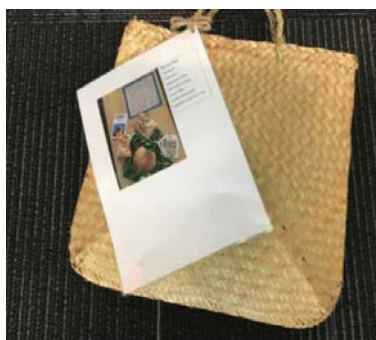
The Lost Sheep