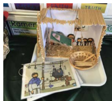
The Paralyse Man

Every Friday some Aroha students are going and leading prayers in Maramatanga and Tika team. They prepare a short prayer session, set up an altar and lead prayers. They have also now had other opportunities to go and assist with Class liturgies as well on a Monday due to COVID level 2.