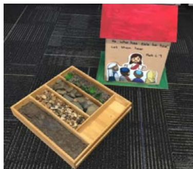
Parable of the sower

These are being launched at prayer time and students are enjoying learning more about the Bible stories.