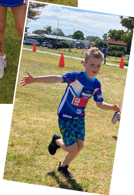
Some photos from last weekends Weetbix TRYathlon